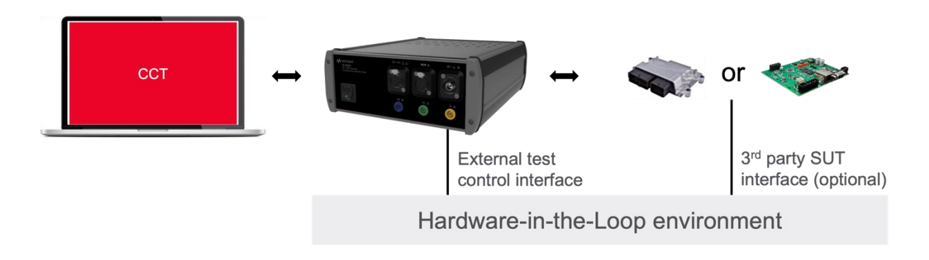
Figure 8. HiL tests of EVCC or SECC with Com Tester and CCT

An advanced testing scenario is HiL testing, where the Com Tester is embedded into a larger test environment composed of the EVCC / SECC under test in combination with other test components that either automate the charging test environment through an external test control interface or stimulate the SUT to enlarge the scope of the component test towards integration tests in a fully automated test environment.