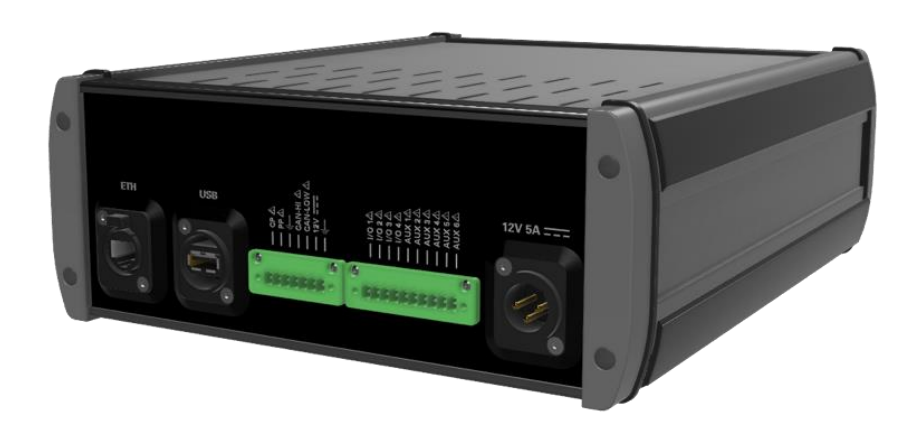
Figure 11. SL1550A Com Tester back panel

The rear panel hosts the 12 V DC power input socket, next to the Ethernet and USB interfaces, as well as a 17-pin socket with multiple predefined I/Os and auxiliary I/Os. The Ethernet connection is used to connect a host PC. The USB interface is reserved for future purposes.