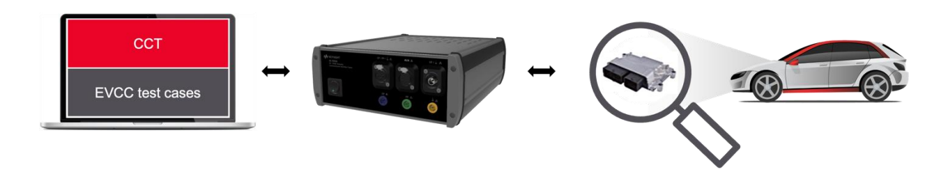
Figure 4 . Type approval tests of EVCC with Com Tester and Charging Communication Conformance Test Software (CCT)

Perform type approval tests of the EVCC or SECC with the Com Tester. In this particular use case, the EVCC or SECC under test is validated against the complete set of test cases with reference to the corresponding conformance test case specifications (e.g. DIN 70122, ISO 15118-4/-5, etc.). This setup is applicable for vendors preparing type approval tests for their customers or for certification bodies.