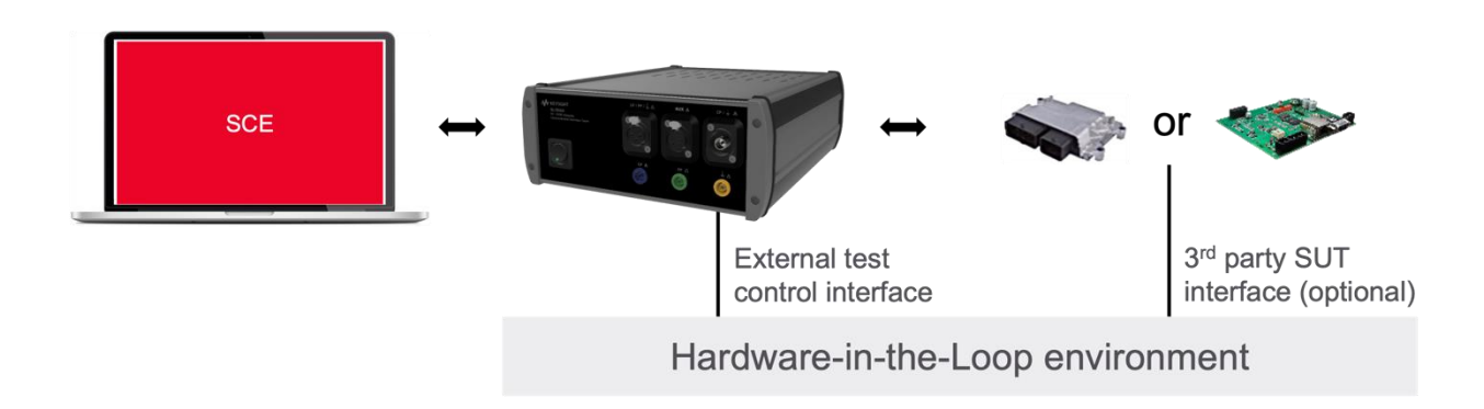
Figure 9. HiL tests of EVCC or SECC with Com Tester and SCE