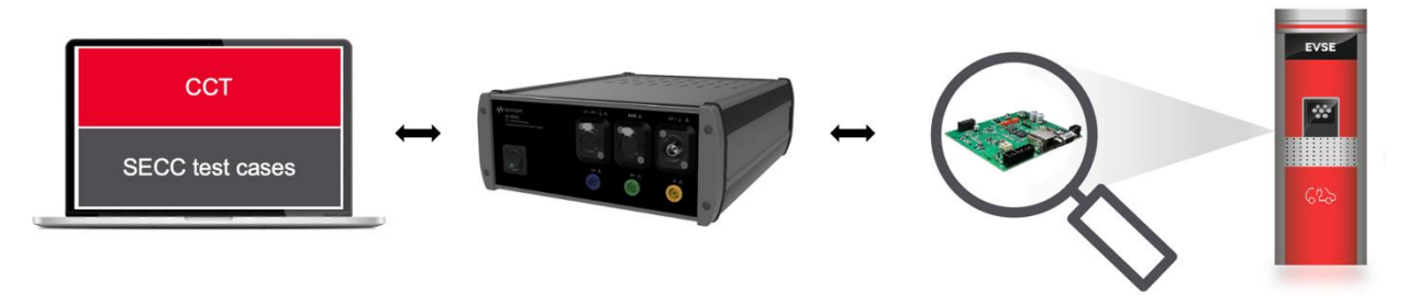
Figure 5. Type approval tests of SECC with Com Tester and CCT