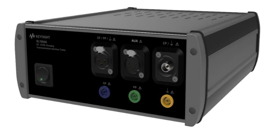
Figure 10. SL1550A Com Tester front panel

The Com Tester supports multiple connectors to connect a SUT. The front panel provides three 4 mm female banana-plugs for CP, PP, and PE besides a BNC plug for additional measurement of the CP signal. In addition, an XLR based 3-pin plug combines all signal connections into one cable. Furthermore, the interface of SL156XA EV - EVSE Charging Test Robot Series can be used to connect automatic (RFID) card swipers or automatic push button actuators.